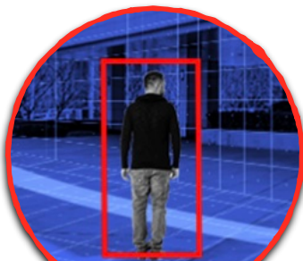
LOITERING, PERSON, OBJECT DETECTION

MINIMIZES CRIMES OF OPPORTUNITY BY PROACTIVELY IDENTIFYING MAINTENANCE NEEDS AND PREVENTING VANDALISM AND OTHER PROPERTY DAMAGE