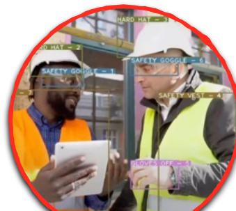
PERSONAL PROTECTIVE EQUIPMENT & SAFETY