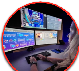
ACTIVE SECURITY MONITORING